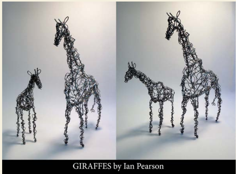
GIRAFFES by Ian Pearson

PLEASE LOG ONTO EDMODO EACH DAY/WEEKEND FOR ANY UPDATES!